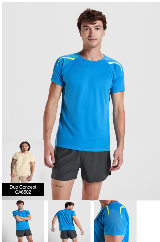
Duo Concept CA6502