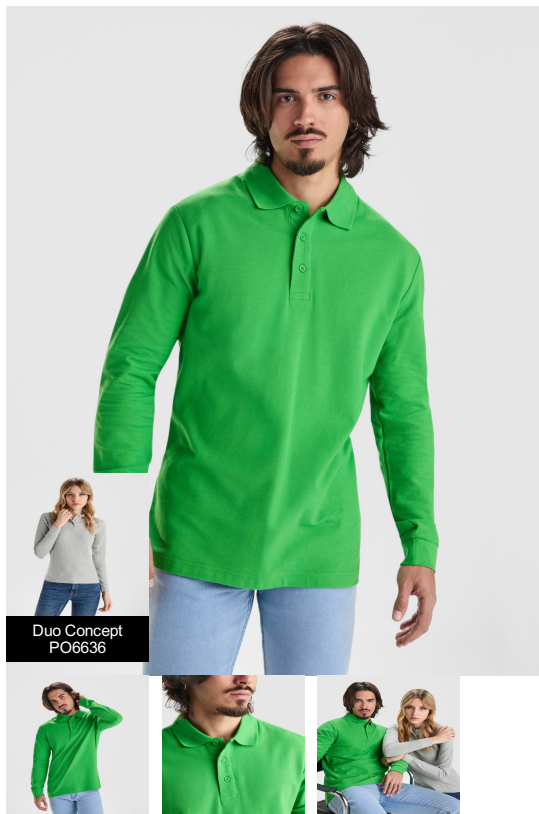
Duo Concept PO6636